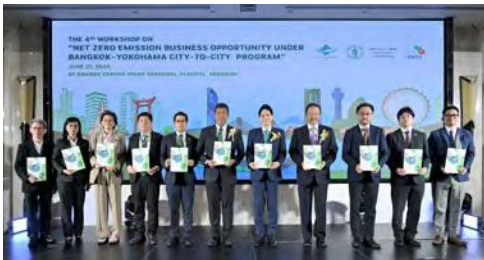
Net Zero Emissions Business Opportunity under Bangkok-Yokohama City-to-City Cooperation (2024)

Y-PORT Center is the one stop shop to bring out private firms' expertise and to provide networking opportunities as needed.