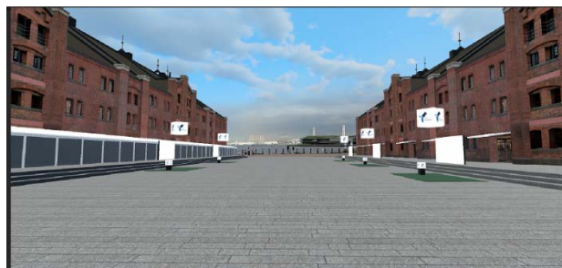
“Yokohama Landmark Tower Dockyard Garden” and “Yokohama Red Brick Warehouse”