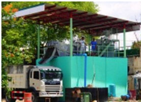
Unit installed in Cebu