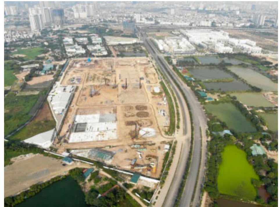
Recent case: Hoa Lac Hi Tech Park near Hanoi